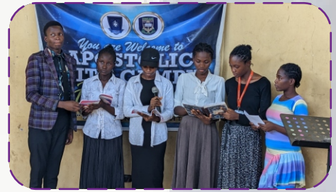
University of Ilorin

The news of admission is a great news and one that brings gladness to every student; however, it is a freedom to endless decision making that perhaps would be unrestricted by parents/guardians. Entry into a higher institution serves as a playground for various imaginations and thoughts, a start of something glorious for some and another step towards the opposite direction for others. The theme “Limitless” is a profound concept that transcends various facets of human experience. It invites us to explore beyond our perceived limitations, to connect with a greater reality, and to realize our infinite potential as children of God. In Christ, our potential is limitless. No matter the background, course of study, strengths or weaknesses, God has a unique plan and purpose for each student. In our campuses, there are certain events or themes that tend to limit students such as the fear of failure, background and meeting up to social expectations. As new students on campus, the change of environment, high level of distractions, also coupled with the academic requirements by the institution, creates a need for the realization that God can give the grace to have a limitless journey amidst the hustle and bustle on campus.