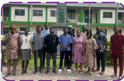
(Members of AFCF on an expansion activity to University of mines and technology, Ghana)