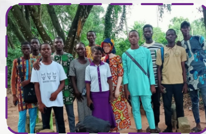
(Fellowship activities in University of Abomey-Calavi, Benin republic)