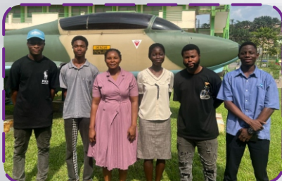
(Members of AFCF on an expansion activity to University of mines and technology, Ghana)