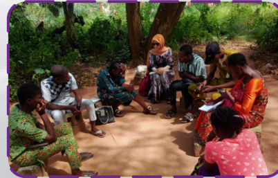
(Fellowship activities in University of Abomey-Calavi, Benin republic)